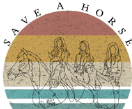
Cait Oponski Corral West Horse Adventures Goodyear, AZ